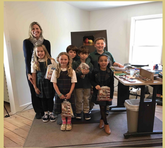
Lower Right: The caterpillars arrived by mail yesterday for the kindergarten class! Each kindergartener has two caterpillars that they will be observing while they transform into butterflies.