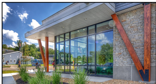
Saint Sebastian Hall Opened September 2021

20 students graduated to 5 different High Schools.